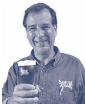
C. JAMES KOCH Age 71 Director since: 1995 CLASS B DIRECTOR NOMINEE